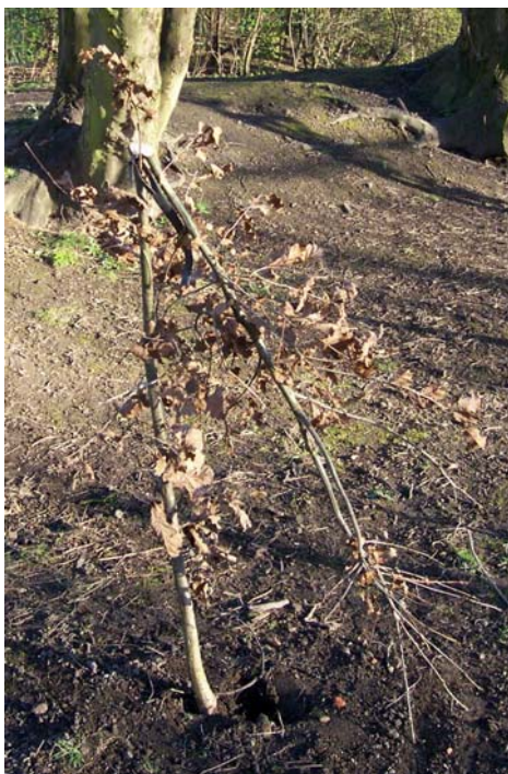
Tree planted last year, snapped in two

On the evening of Tuesday 26 February 2008, sometime between 5:30 and 6:30pm, someone attempted to destroy virtually the whole of the work which had been undertaken by members of the community only two days before. The woodland, on that evening, can best be described as a scene of total devastation. The newly planted trees and supporting stakes were broken and up-rooted and stakes thrown all around the woodland. Although members of the friends group quickly worked to rectify most of the damage it is nevertheless a very demoralising incident. However, the Friends Group is determined that these potential setbacks will not deter the group from continuing to work towards enhancing the facilities within the park and woodland area.